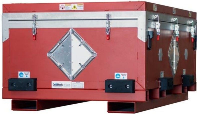
Damaged, Defective, Recalled (DDR)